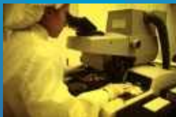
Research & laboratory reports