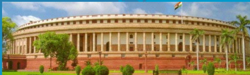
Government reports & policies