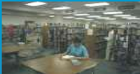
Library & reference