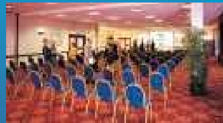
Electronic meeting & communication